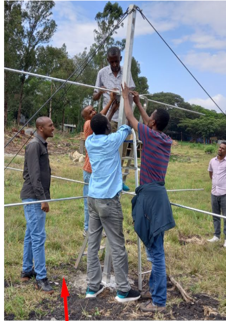
PhD students assembled Meteor Radar antenna at Bahir Dar University