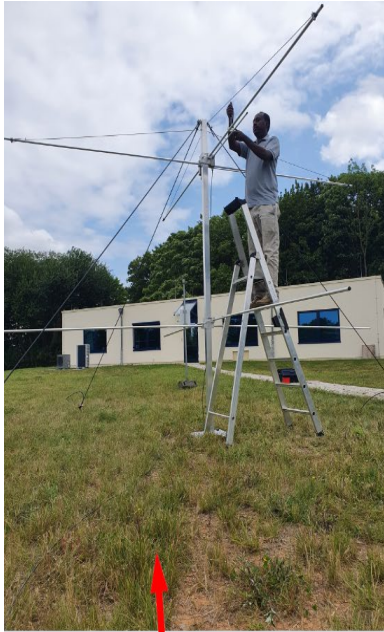
Training on assembling Meteor Radar antenna in Germany