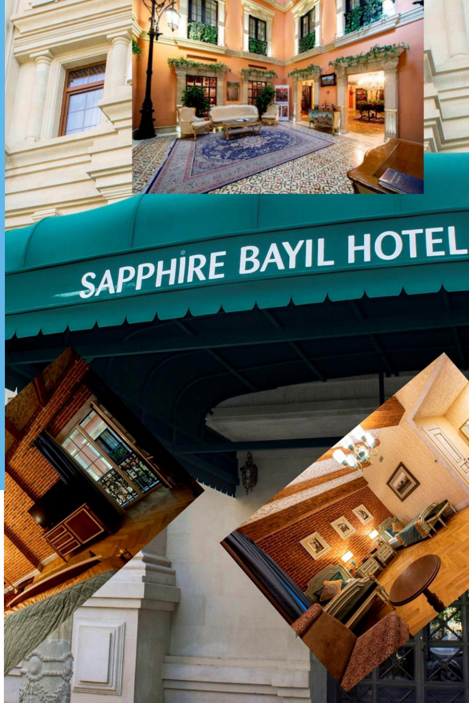
Sapphire Bayil Hotel, Baku, Azerbaijan