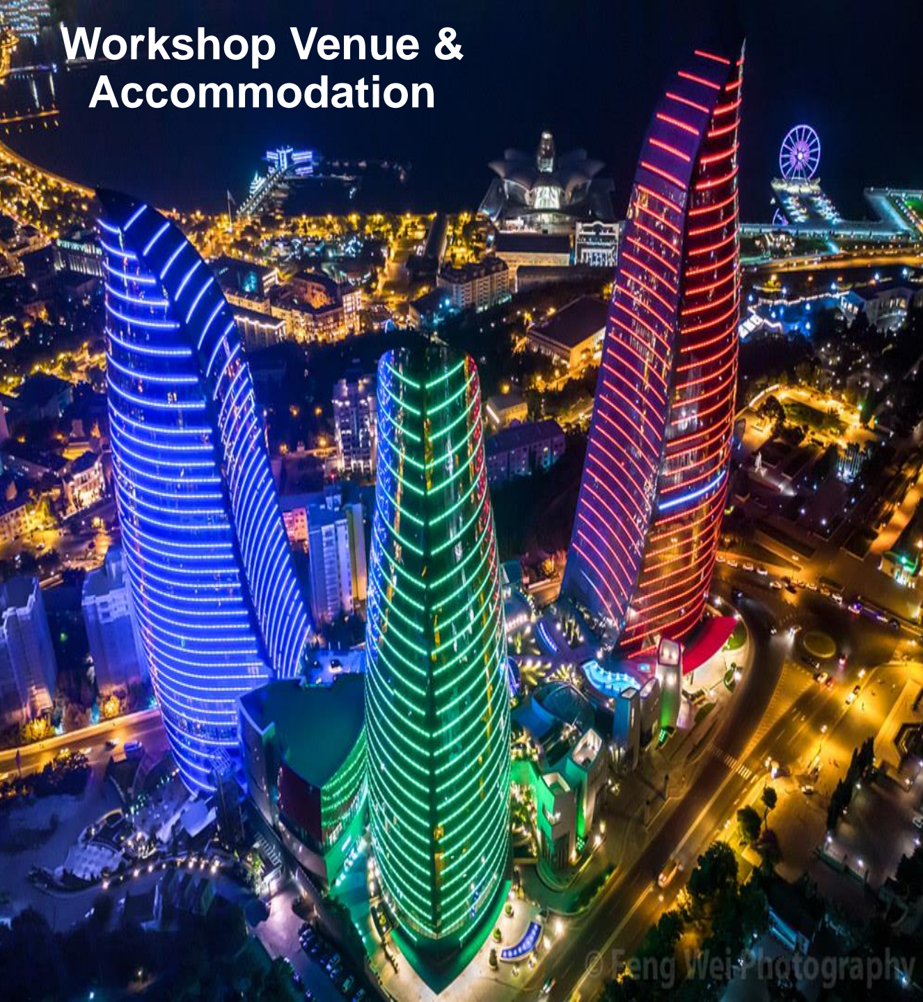
Flame Towers at night, Baku, Azerbaijan