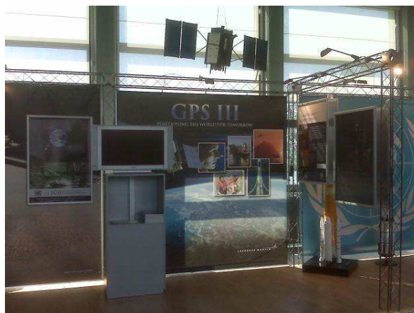
Fig. 6 A model of a GPS Block III satellite in the United Nations Permanent Space Exhibit

Ionospheric modeling using Global Positioning System (GPS) data is the focus of extensive efforts within the GPS community (see Fig. 6). The range error caused by ionospheric delay in GPS signals is currently the largest component that affects the accuracy of positioning and navigation determination using single frequency GPS measurements. Ionospheric modeling is an effective approach for correcting the ionospheric range error and improving the GPS positioning