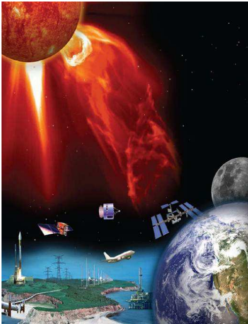
Fig. 1 The impact of solar activity on planet Earth