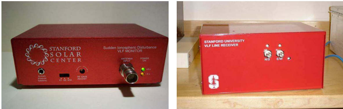
Fig. 3 SID and AWSOME instruments (Stanford Solar Center)

their local high school or university and can thus become part of the worldwide SID or AWESOME instrument array (see Fig. 4).