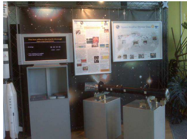
Fig. 2 ISWI displays in the UNOOSA permanent space exhibit at the United Nations Office at Vienna

For many years UNOOSA has maintained the United Nations Permanent Space Exhibit located at the Vienna International Centre. The exhibit is one of the highlights of the public tours conducted by the United Nations Information Services (UNIS) at the United Nations Office at Vienna. Each year