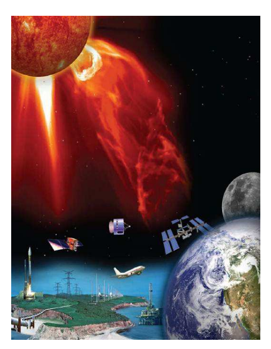
Fig. 1 The impact of solar activity on planet Earth (NASA)