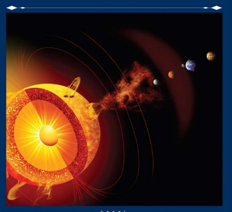
IHY INTERNATIONAL HELIOPHYSICAL YEAR 2007