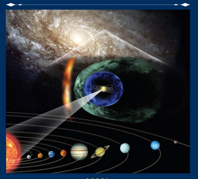
IHY INTERNATIONAL HELIOPHYSICAL YEAR 2007 WWW.IHV2007.0KG