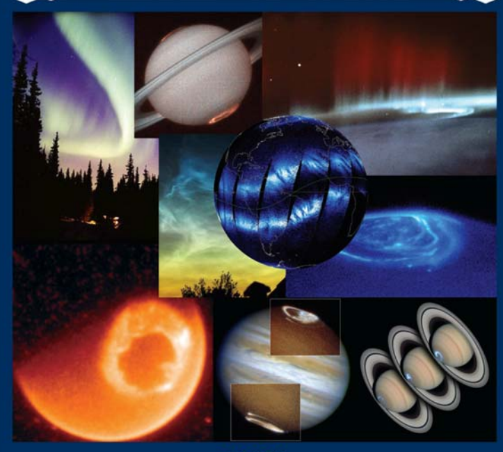
IHY INTERNATIONAL HELIOPHYSICAL YEAR 2007 www.hy2007.org