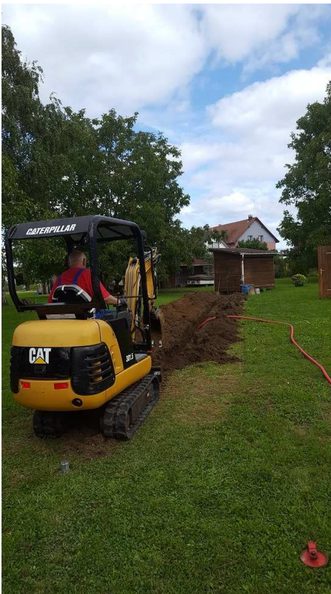
Fig. 2: Preparation of a ditch for the tube carrying the coaxial cable for the LWA . Thanks to Max for all the ground work required for electrical power and rf-cabling. Red tube is carrying two coaxial cables, one per linear polarization from the LWA. Coaxial cable are also used to supply the LWA with dc-power 15 volts.

Recently a new station has been installed and set up in Landschlacht , north-east of Switzerland. Instrument has been moved from Bleien to Landschlacht because I'm getting retired and cannot take care about the instrument at Bleien any-more. In addition, interference level has been increased in Bleien which was another reason to move the instrument to Landschlacht to private properties.