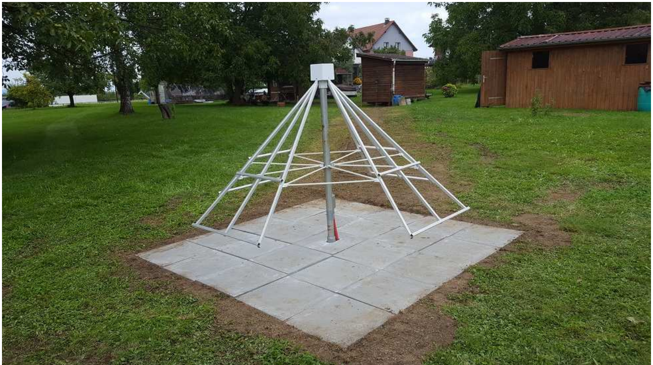
Fig. 3: Long Wavelength Antenna (LWA) on private property in Landschlacht. Wooden shed in the background hosts 90° quadrature hybrids, power supplies, spectrometers, converters and computer.