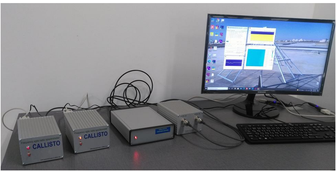
Fig. 2: From left to right: 2 spectrometer CALLISTO, dual channel heterodyne up-converter, power supply and 90° quadrature hybrid to convert linear polarization into circular polarization, PC.