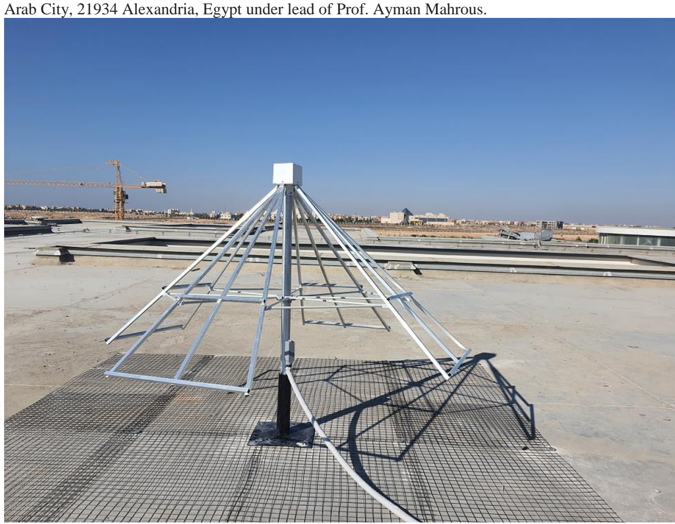
Fig. 1: LWA on the roof of the University with ground mesh to improve beam pattern. Frequency range 10 MHz - 80 MHz.

Recently a new spectro-polarimeter, based on LWA and CALLISTO has been installed and commissioned in Alexandria, Egypt. The host is Space Environment Research Lab (SERL), Institute of Basic and Applied Science (BAS) Egypt-Japan University of Science and Technology, New Borg El-