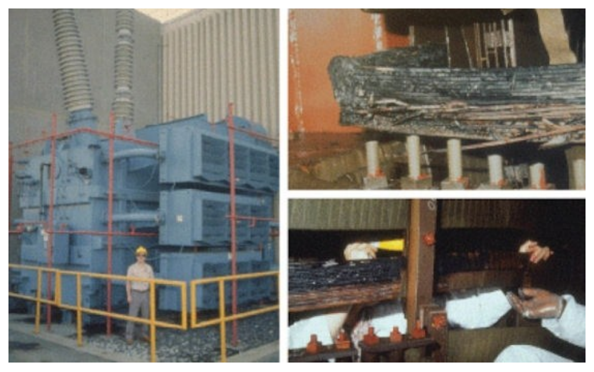
Permanent damage to the Salem New Jersey Nuclear Plant GSU Transformer caused by the severe geomagnetic storm of 13 March 1989

Solar energetic particles at the magnetic poles can force the re-routing of international airline flights resulting in delays and increased fuel consumption. Ground induced currents generated by magnetic storms can damage transformers and increase corrosion in critical energy pipelines.