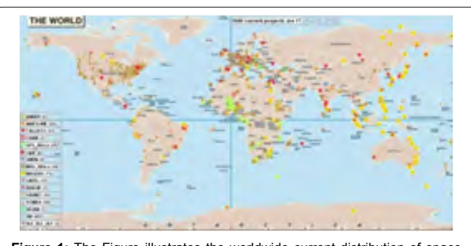
Figure 1: The Figure illustrates the worldwide current distribution of space weather instrument arrays in operation.

A series of workshops on basic space science was held from 1991 to 2004 (India 1991, Costa Rica and Colombia 1992, Nigeria 1993, Egypt 1994, Sri Lanka 1995, Germany 1996, Honduras 1997, Jordan 1999, France 2000, Mauritius 2001, Argentina 2002, and China 2004;