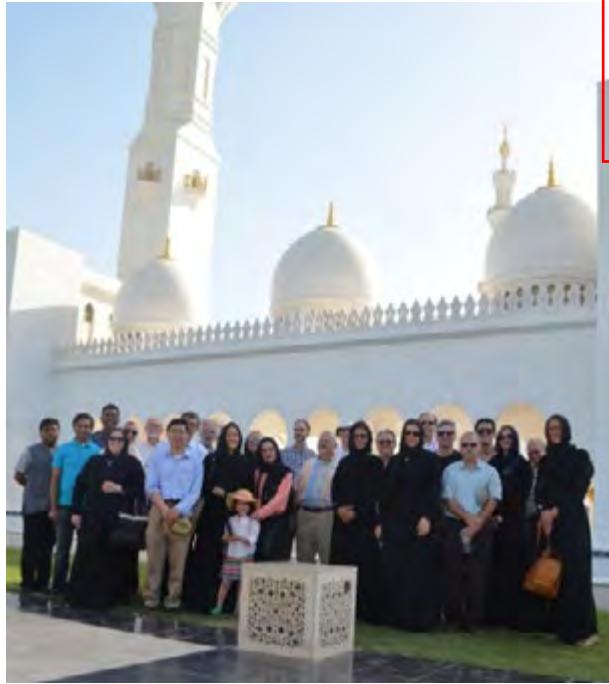
Photo of the participants at the Sheikh Zayed Grand Mosque in Abu Dhabi.

As the organizers noted, the History of Science, Technology, and Medicine (HSTM) field, since its inception, has been dominated by studies written in a national, colonial, or area-studies frame. This remains the case today, although recent scholarship has increasingly drawn attention to the significance of global transmission and exchanges of technical knowledge, materials, and experts in shaping the process of scientific, technological, and medical change in regions around the world. Yet, as historians have moved towards writing