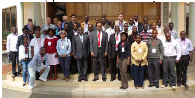
Group photo of the school in Kenya

The next SCOSTEP/ISWI school will take place in Peru from September 15 to 24, 2014.