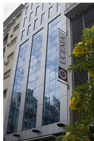
UCEMA building of Reconquista 775, located in downtown Buenos Aires, at the heart of the financial and cultural activity of the country