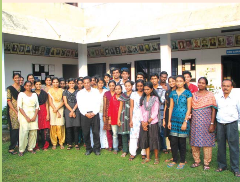
15 th UG Camp group photo

up to five students. The program is open to all in India and abroad but due to random changes in examination schedules in the universities in Kerala it is not possible to fix the dates of camps in advance and give sufficient notice which will enable participation from outside Kerala. In each camp the top three students are given prizes in the form of books. All are given participation certificates and course certificates. The course certificates also contain the cumulative grades in all their examinations. On the 3 rd , 6 th and 10 th days there are one hour written tests, the tests are cumulative, and on the 10 th day there is an individual viva also. The cumulative grades from all these four tests will appear in their certificates. Those who score 50% or more are considered as having passed the course work. A number of students who had gone through CMS camps had passed national competitive examinations and secured admissions in several national institutes of excellence.