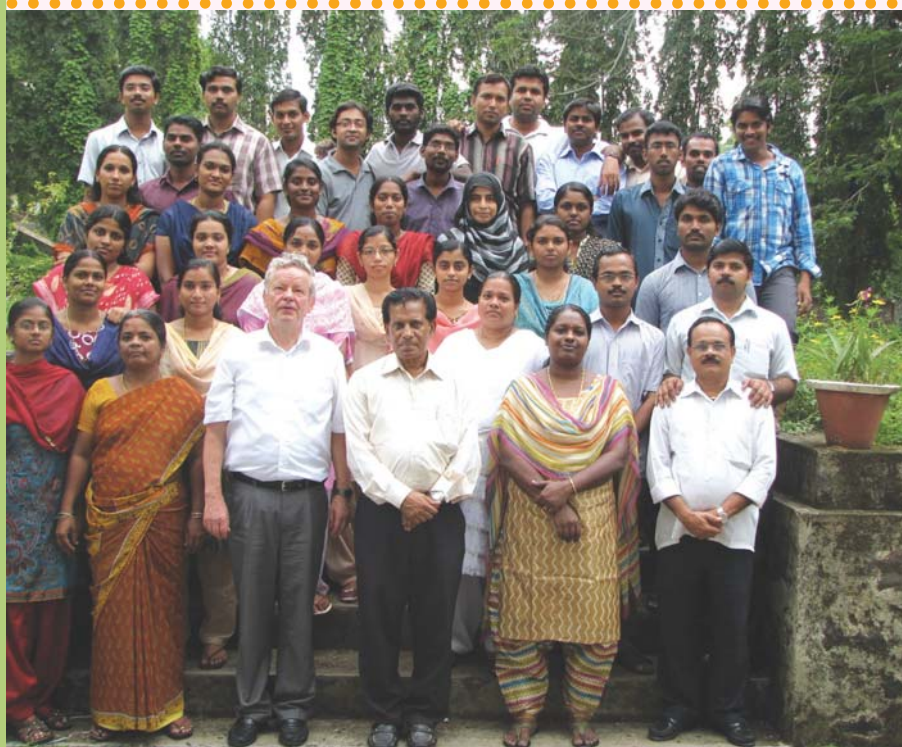
2012 SERC group photo