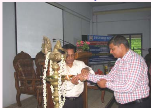
2012 SERC valedictory