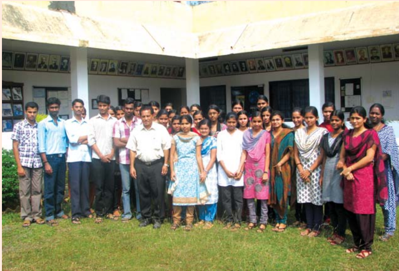
16 th UG Camp group photo