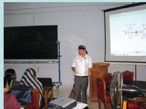
Lectures at 2012 SERC School