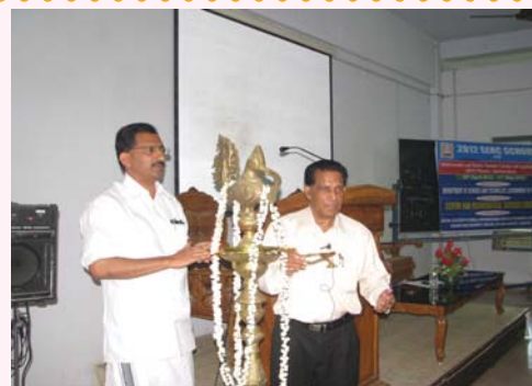
2012 SERC inauguration