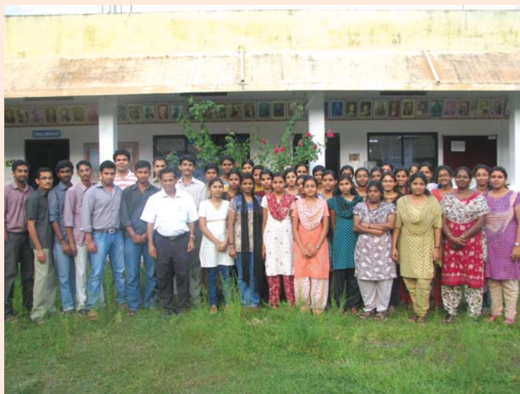
14 th UG Camp group photo

The 14 th , 15 th and 16 th undergraduate Mathematics training camps were conducted in August-September and November 2012. The 17 th camp will be conducted from 21 st December 2012. This will complete the four proposed camps for 2012. Undergraduate camps are sponsored by the Department of Science and Technology, Government of India (DST). 30 participants are financed by DST, including their travel, accommodation, food and study materials, and the remaining ones by CMS. The camps are open to first, second and third year degree students (B. Sc level) and each camp is of 10 days duration, continuous for 10 days with around 40 hours of lectures and 40 hours of problem-solving sessions, usually conducted during the holiday time for regular college students so that they could come and