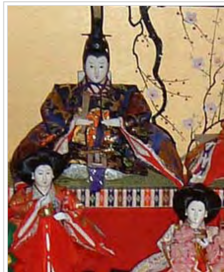
An Emperor doll, with two handmaidens.

The traditional arrangement had the male on the right, while modern arrangements had him on the left (from the viewer's perspective).