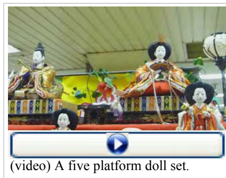
(video) A five platform doll set.

Accessories placed between the ladies are takatsuki (高坏), stands with round table-tops for seasonal sweets, excluding hishimochi .