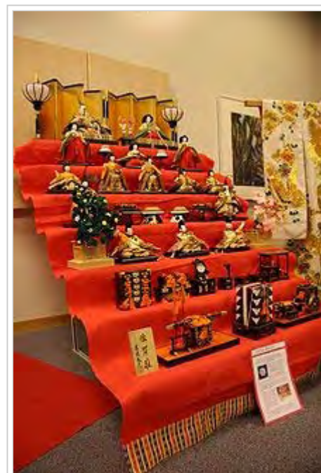
Seven-tiered Hina doll set