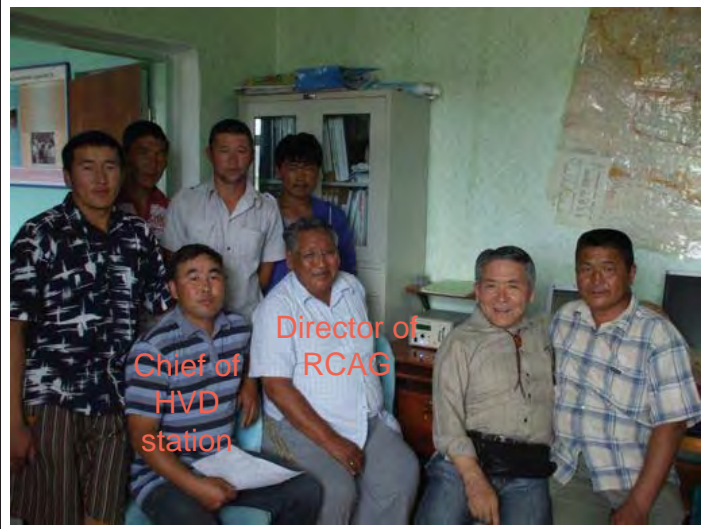
Chief of HVD station Director of RCAG