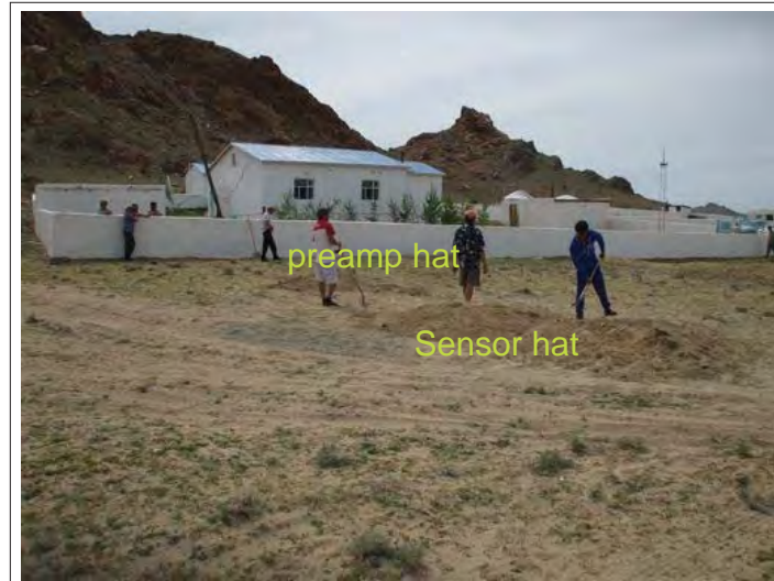
preamp hat Sensor hat