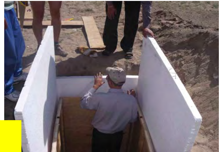
Construction of sensor house (floor is 1.5m below surface).