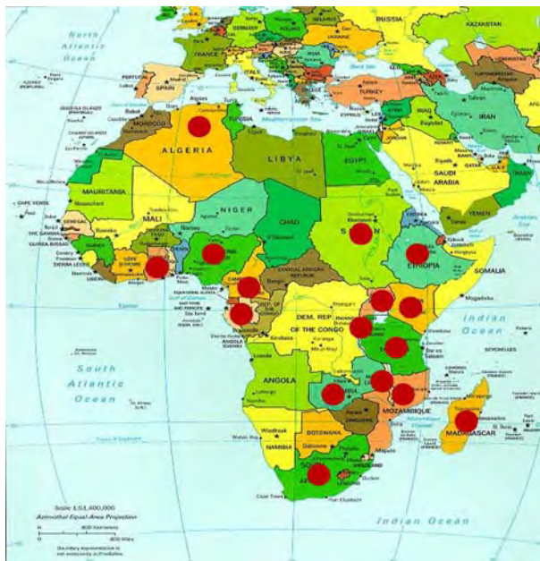
Figure 1. Distribution (red dots) of ISWI 2010 summer school participants among African countries.

The school was organized by a committee that comprises of local and international members. A list of the members of this committee appears in Appendix A . A total of 56 delegates attended the school in Ethiopia. Of these delegates, 42 represented 16 different African countries ( see Figure 1 for the distribution of the participants) and 14 instructors travelled from 6 different countries (8 from USA, 1 from Canada, 1 from Germany, 1 from Japan, 1 from Nigeria, and 2 from Ethiopia). The list of African countries represented at the workshop is given in Appendix B , and a complete list of delegates can be found in Appendix C .