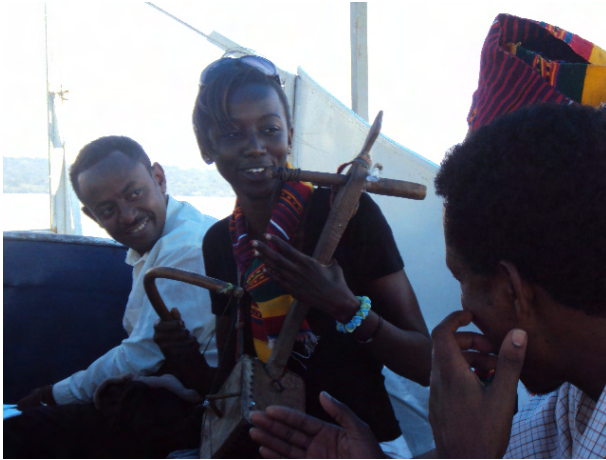
Figure 4. One of ISWI summer school participant from Kenya playing with one of the Ethiopian musical instrument, called “Masinko”, during her way to the Lake Tana monasteries.

This Summer school would have not been possible without the support of the sponsors, who are listed at the front of this report, and our special thanks go to all sponsors. The school also would have not been successful without the support and hard work of the Ethiopian organizing team.